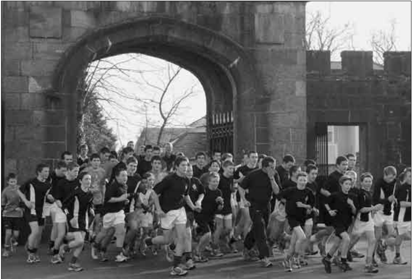
A number of the students who regularly went on structured training runs in the Castle Park.