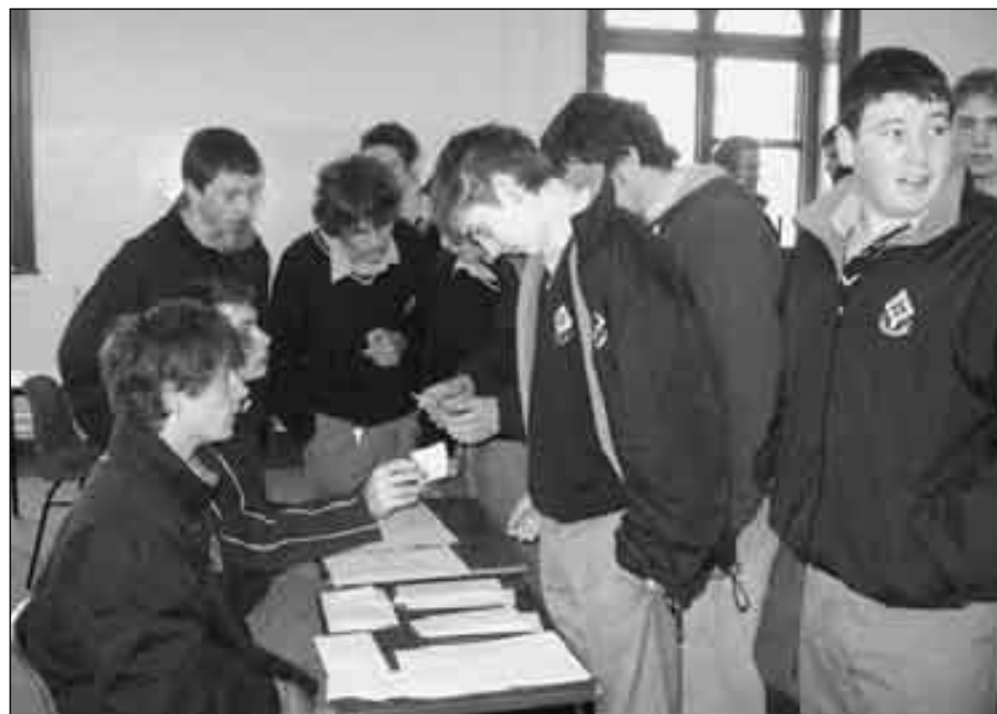
Students preparing to vote for the student council