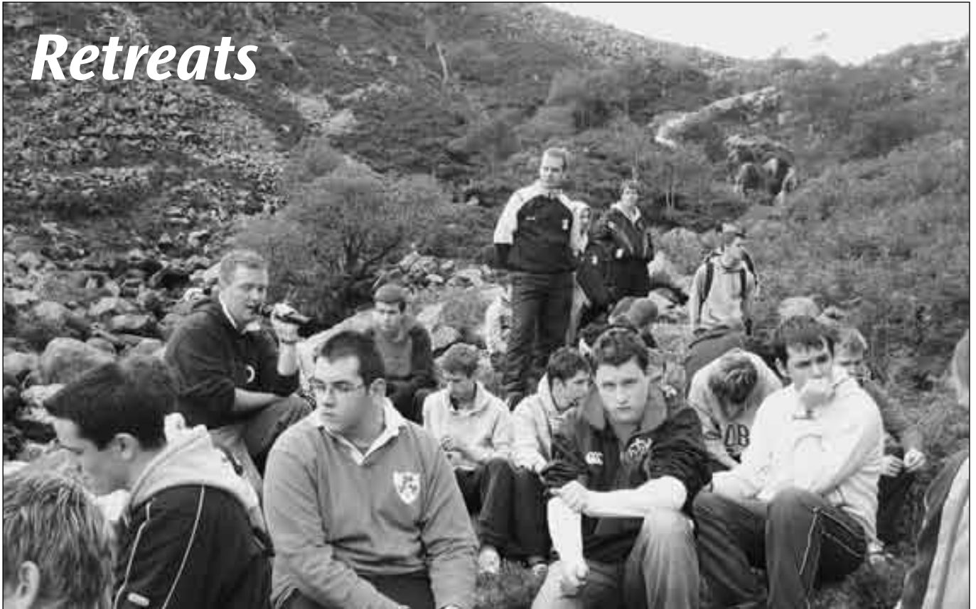
Pictured are some of the Leaving Cert. students while on Retreat during the year.

Since September 2006 all of the students in St. Kieran's College have received a class retreat. These retreats took many different forms. Our First Years went out to the retreat centre in Callan, Second Years to Grace Dieu in Waterford, Third and Fourth years to Kiltegan, Co.