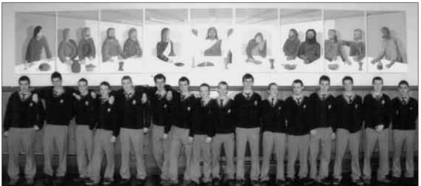
The students involved in painting the Last Supper stand under the finished work in the refectory.