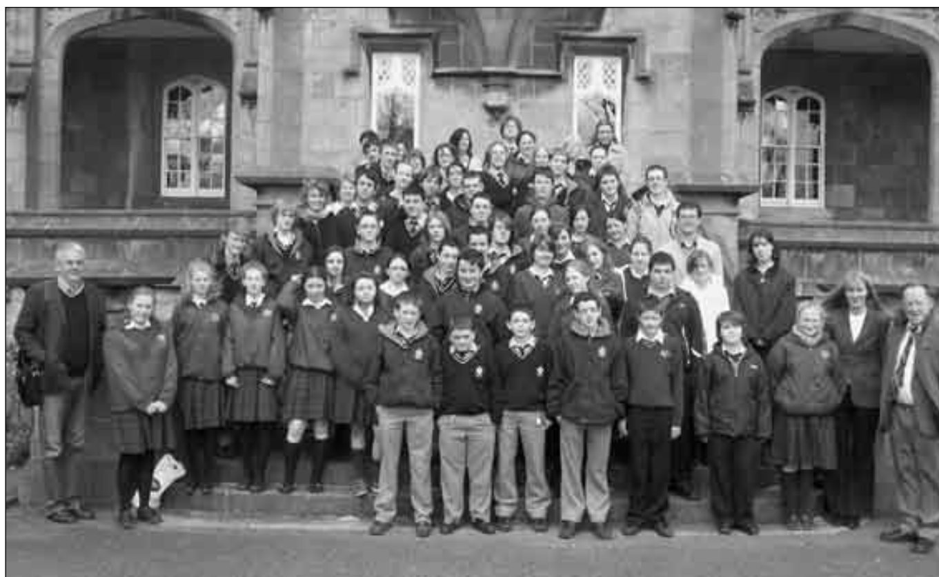
Students from the South East of Ireland who were competing in the 'Poetry Aloud' poetry competition in St.Kieran's College.