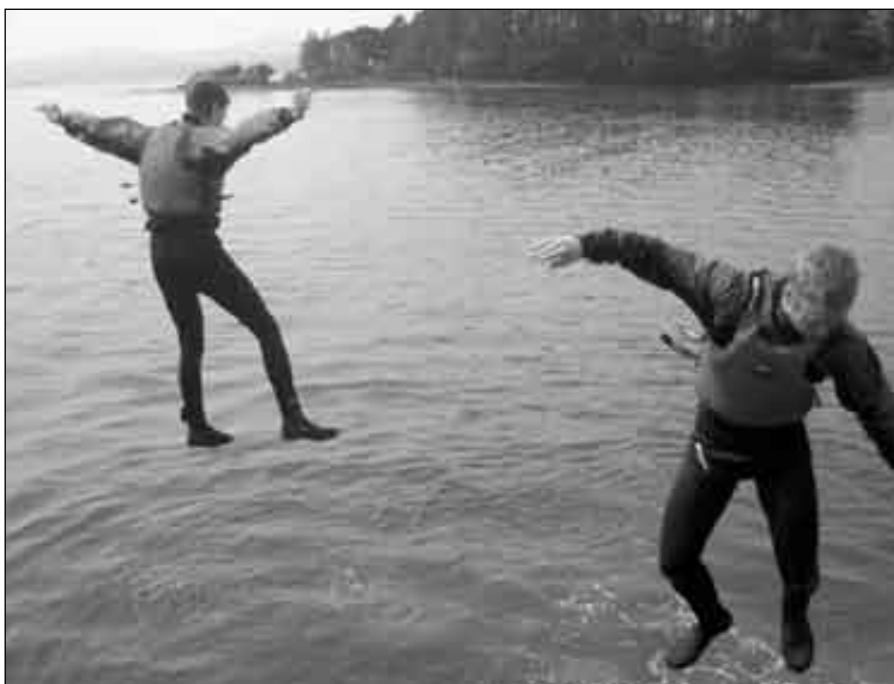
Students at Kenmare Completing activities as part of their President's Award

For those who haven't kayaked before, let me just say that moving in a straight line is easier said than done. The morning was spent around the pier learning basic paddle strokes, learning how to "raft up" and pretty much going where ever the tide wanted to take you. Later on we were given lunch in the centre and then it