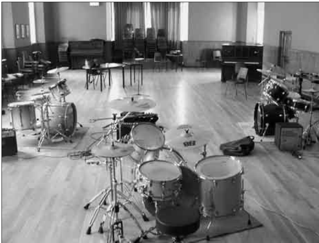
Some of the equipment in the theatre during this year's music practicals.

visited our school gave coaching sessions, short recitals, demonstrated their instruments, explained about the orchestra and also about the music they perform. It was undoubtedly one of the musical highlights of the school year.