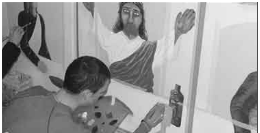
Students working on the painting of The Last Supper)