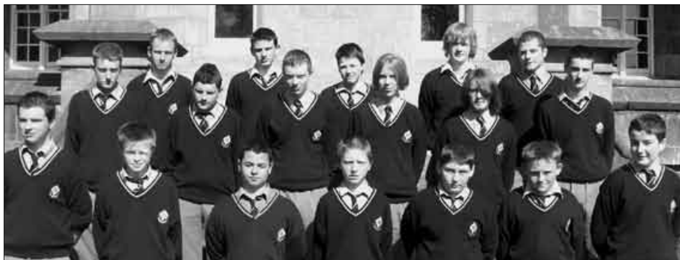
Pictured are the members of the new Student Council.