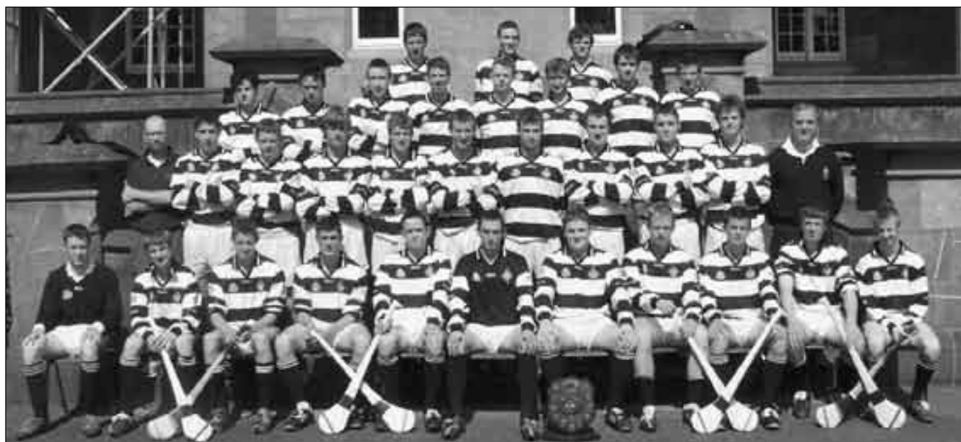
St. Kieran's College Senior Hurling panel.