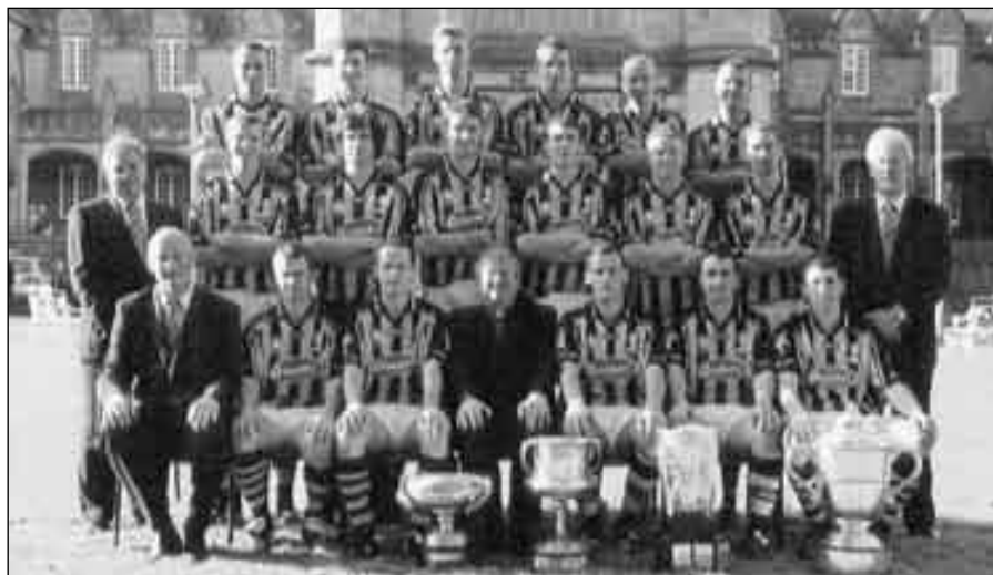
Members of the Kilkenny senior All-Ireland Team who are past pupils of St. Kieran's College.