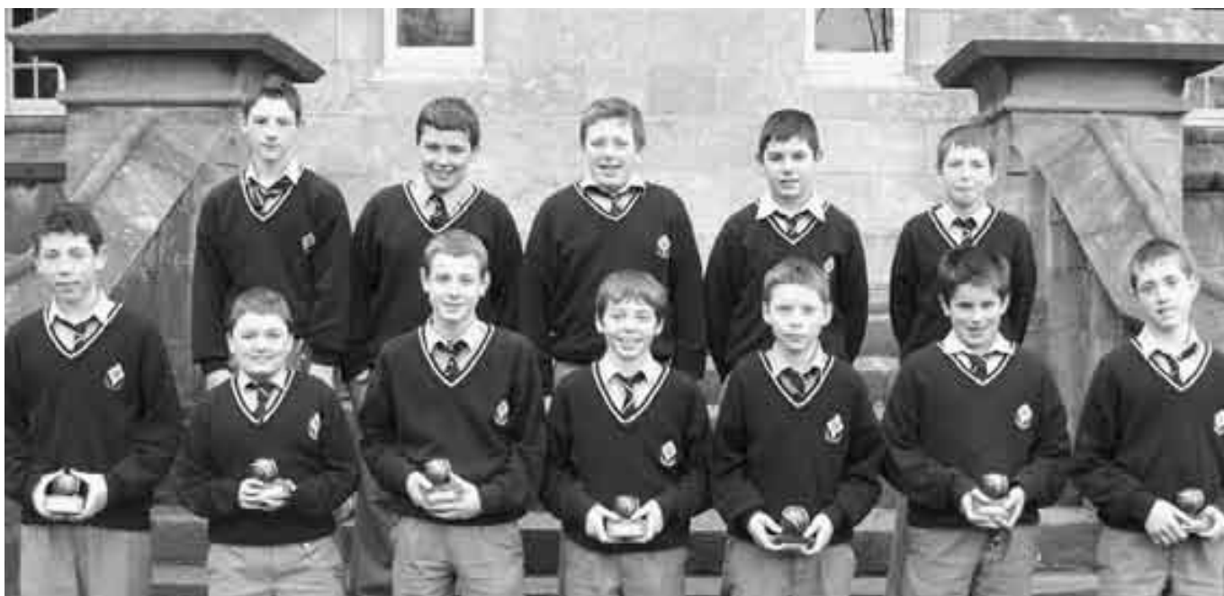
First Year Hurling League winning team.

Traditionally, the First Year hurling league is the students' introduction to hurling in St. Kieran's College. These leagues are unique in that they cater for all abilities i.e. anyone interested in hurling is given the opportunity to play- which is the true meaning of amateur sport.