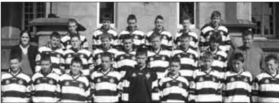
The U-16 "B" Panel.

The Juniors began the campaign with a good win away to St. Mary's CBS Enniscorthy. Their next outing was at home against St. Brendan's Community school, Birr which the away team won by five points. The score was St. Kieran's 3-6, Birr 4-8.