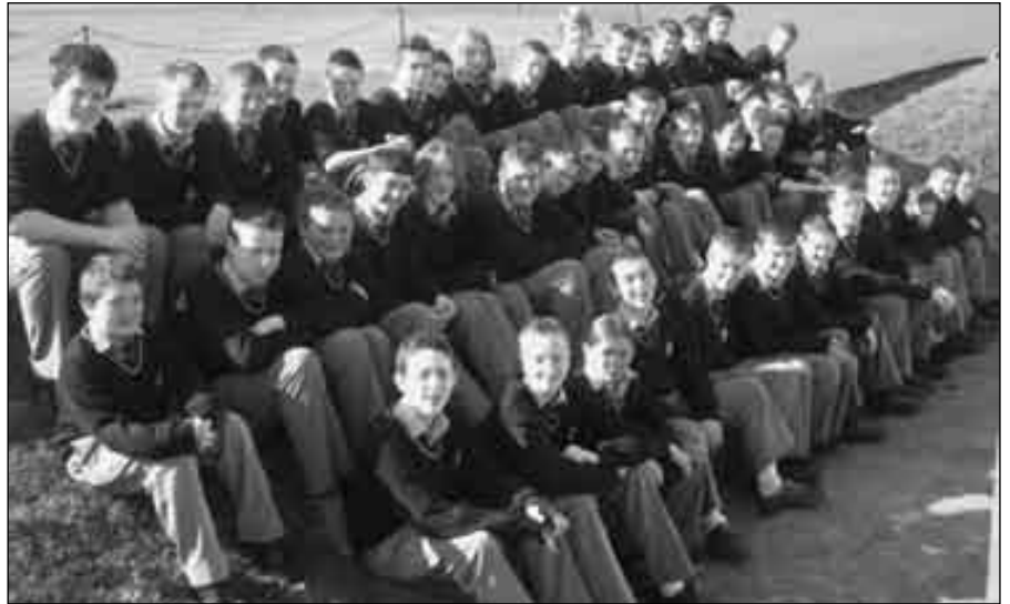
Members of the school choir who sang at the various Liturgies throughout the year and to raise money for Bothar at Christmas